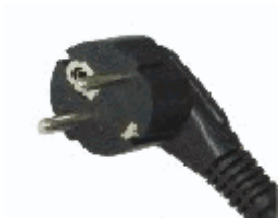
DIN49441 16A plug